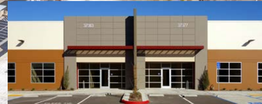
BUILDINGS 24 & 26