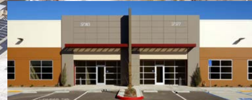
BUILDINGS 24 & 26